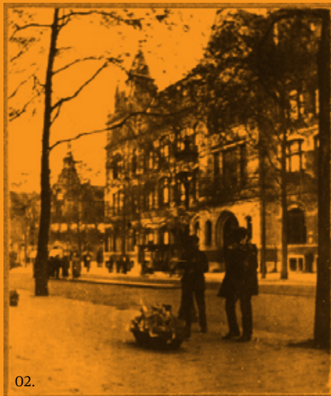
01. Rijkspostspaarbank 02. Van Baerlestraat 03. Paulus Potterstraat

In a vision to restore its former beauty, award-winning Milan-based designer, Piero Lissoni, guided the creation of the hotel whose rich historical narrative is woven with utmost care into its very fabric. The Conservatorium hotel is once again on the pulse of the city's cultural and architectural heartbeat.