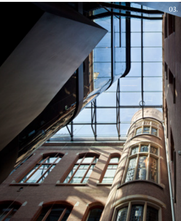
01. Conservatorium hotel 02. Historical stairs 03. Glass building